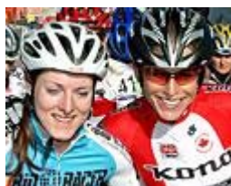
Cyclo-cross World Cup