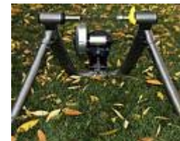
The legs stand a generous 70cm-wide for rock solid stability.