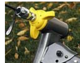
The legs lock in both the extended and folded positions.