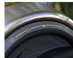
The four-position dial offers an ultra-easy spin setting

Need something a little more progressive? CycleOps also offers the JetFluid Pro, which offers a more realistic road feel and runs quieter but lacks the