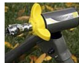
The new mounting system is easy to use

As expected, the 'interval' and 'mountain' settings juice up the resistance significantly for when it comes time to do more serious work. Things still don't feel much different at 16km/h but 32km/h requires a much more vigorous 270W and 350W or so. At 48km/h you'd better bring your A-game: we had to put out over 500W on 'interval' and a painful 600W+ on 'mountain' so most serious riders shouldn't have much of an issue getting enough resistance out of the SuperMagneto unit.