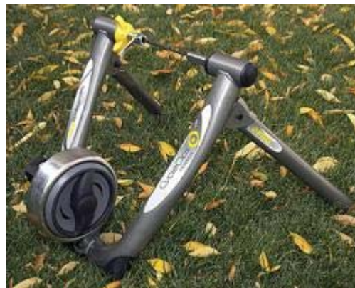
The CycleOps SuperMagneto Pro mates a clever magnetic resistance unit

CycleOps overhauled its trainer line for this winter season with all-new frames and resistance units. Cyclingnews technical editor James Huang finds the SuperMagneto Pro expensive but packed with excellent design and a surprisingly flexible resistance unit.